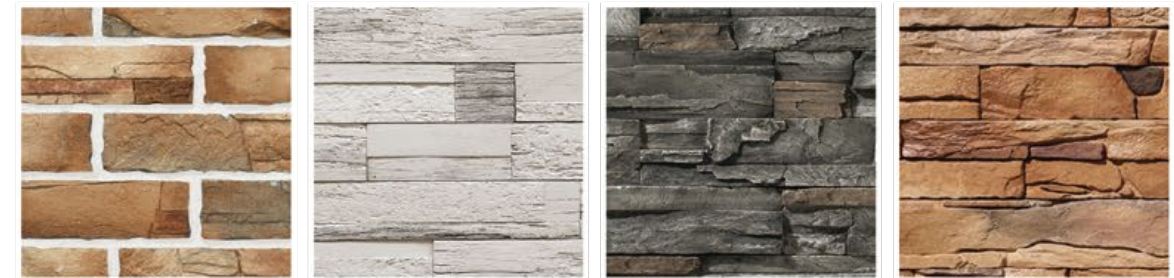
BK-4101 RM148 WS-3002 RM187 DS-401 RM189 DS-802 RM235