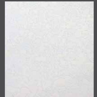
JUMBO-HEAD CUT (S)