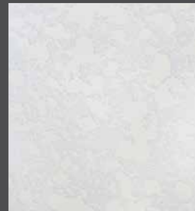
JUMBO-HEAD CUT (L)