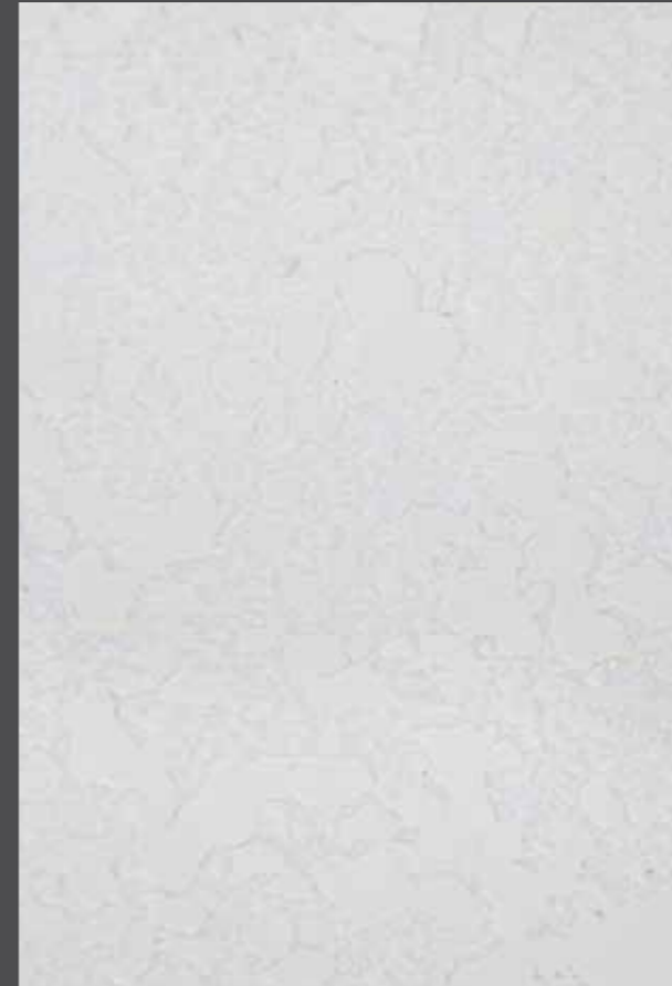
JUMBO-HEAD CUT WITH PU COATING (L)