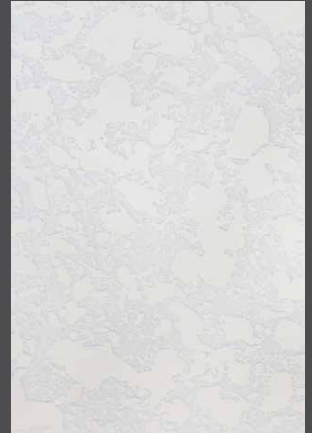
JUMBO-HEAD CUT (L)