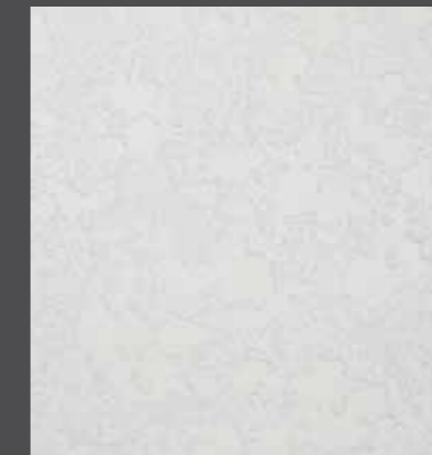
JUMBO-HEAD CUT (M)